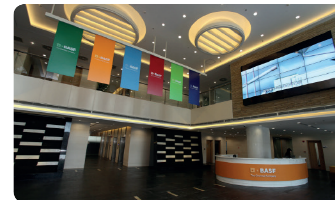
BASF's Greater China Headquarters, Shanghai