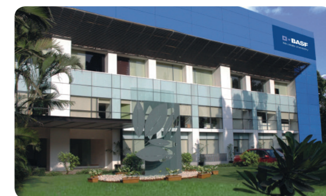
BASF in India, Mumbai