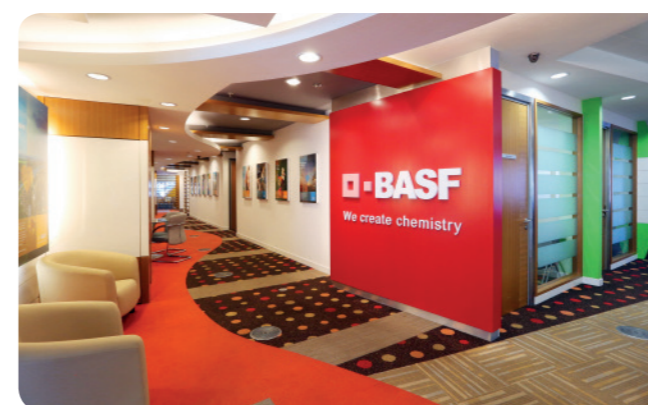
BASF Shared Services Center, Kuala Lumpur