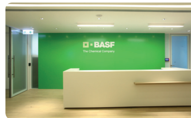
BASF's Asia Pacific Regional Headquarters, Hong Kong

To bring innovation closer to customers in the region, BASF is also substantially expanding its research and development (R&D) capabilities in Asia Pacific. The Innovation Campus Asia Pacific in Shanghai and Mumbai aim to serve as key hubs of global R&D network to co-create innovations and applications together with customers in the region. In addition, BASF has established industry-specific R&D Centers in key markets, such as R&D centers for Electrical & Electronics in Korea, for battery materials in Japan, for water solutions in Singapore and for mining in Australia.